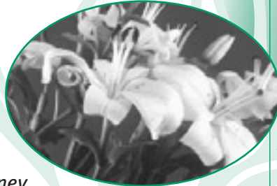
A Tiger lilly. Very beautiful. Absolutely deadly for cats.

A lthough lilies are flowers commonly used in floral arrangements, and cats often have access to them, most cat owners and florists, and indeed many veterinarians are unaware of lily intoxication as a potential cause of kidney (renal) failure in cats.